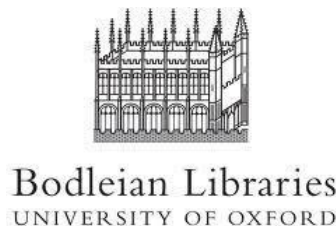
Figure 1: Bodleian logo

These aren't the only two libraries available to you: students who are members of the Oxford Union 3 can use and borrow from the Union Library and all students can use the main Bodleian library, although they can't borrow from it. However, there are a huge number of other Bodleian libraries that exist - most of which look utterly gorgeous, and all of which are worth investigating. In addition to being an invaluable source of books, they also provide a quiet environment in which to work.